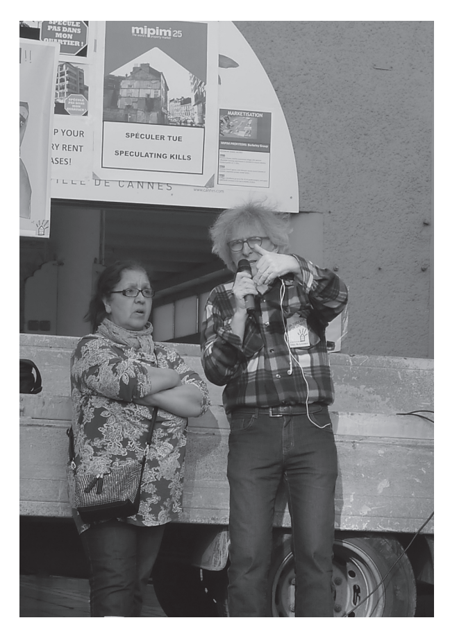
Cannes, Tribunal Anti MIPIM