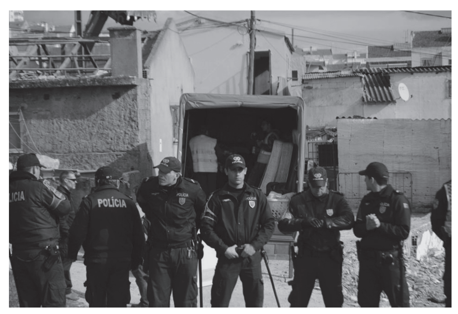
Demolitions and evictions in Portugal