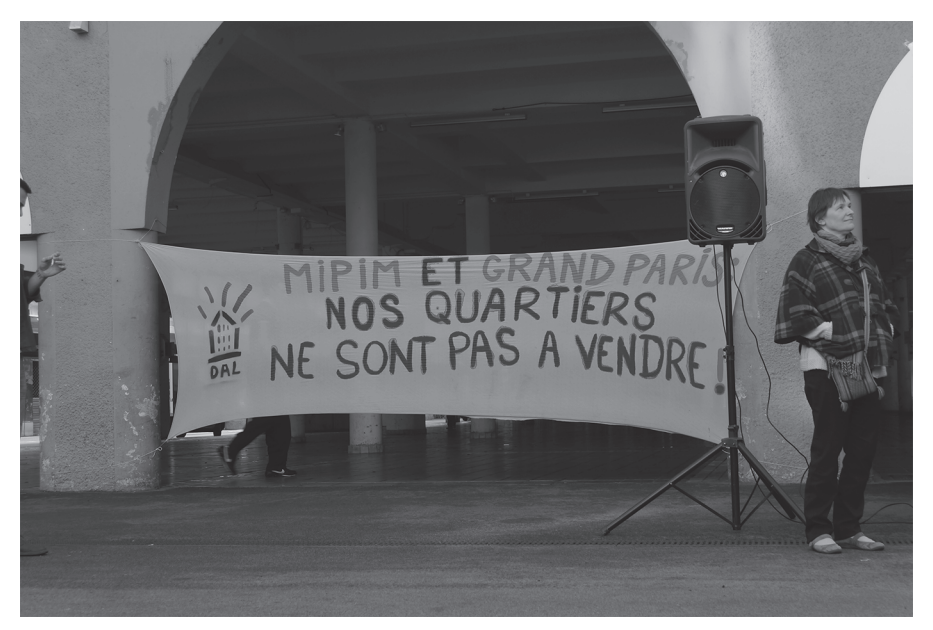
Cannes, Tribunal Anti-MIPIM

they are confidential. Common sense says that a viability system that allows a developer to make massive profits and yet deliver few affordable homes must be fundamentally flawed.