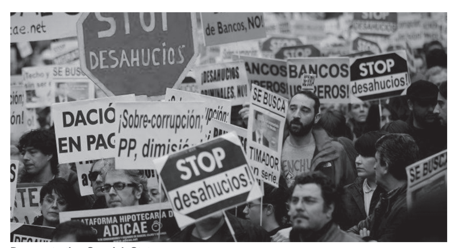
Demonstration Spanish State