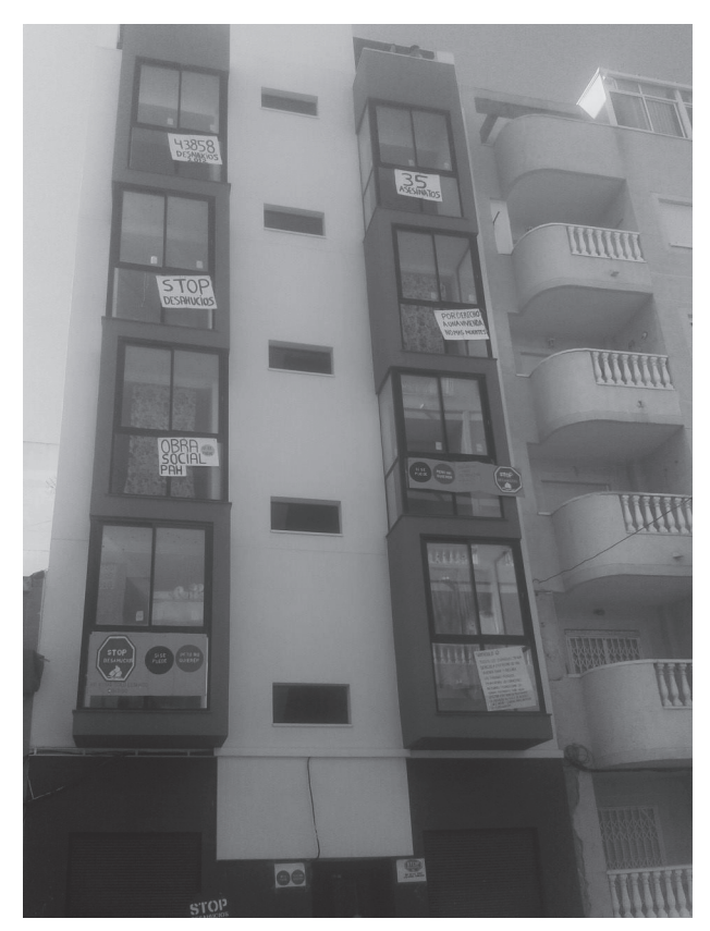
Spanish State "Stop Evictions"