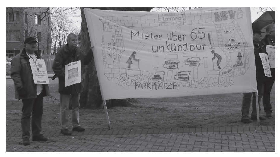
Demonstration Ruhr Metropolitan Area