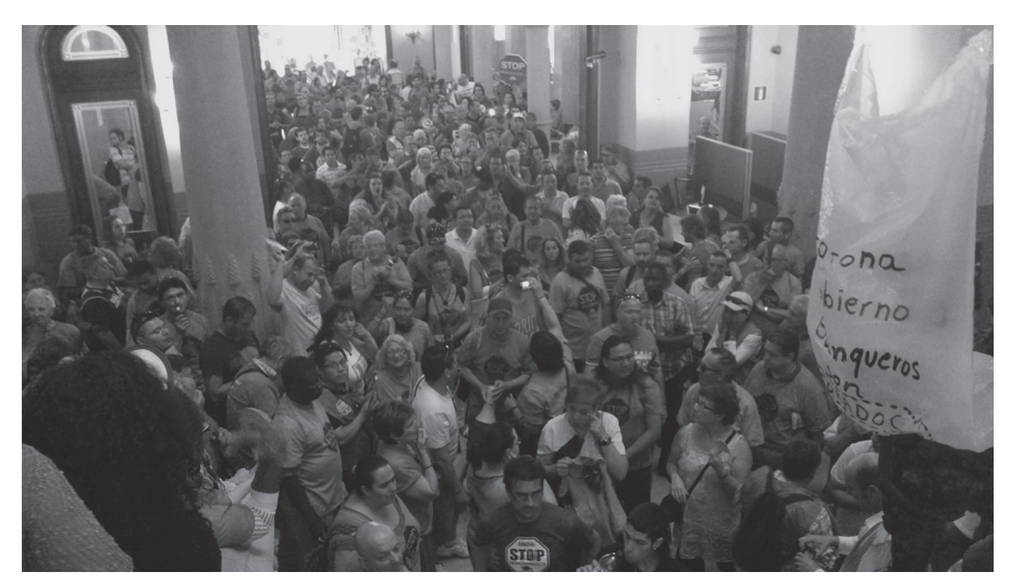
Ocupation of a bank in Spanish State